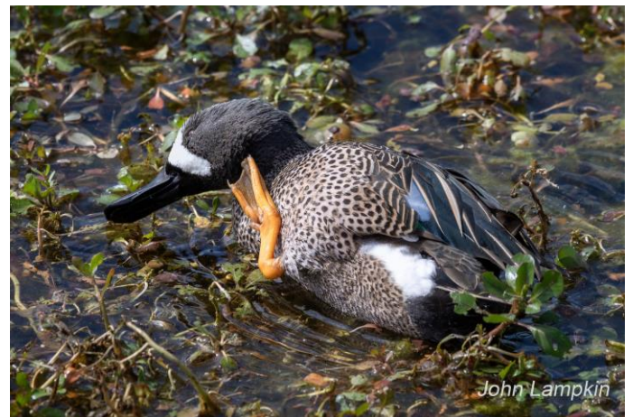
Blue-Wing Teal Scratching