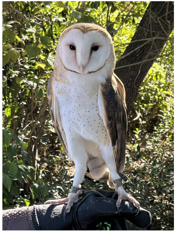
Florida Barn Owl