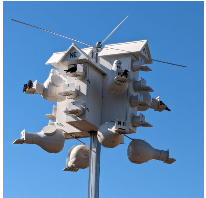
Purple Martin Condo Celery Fields