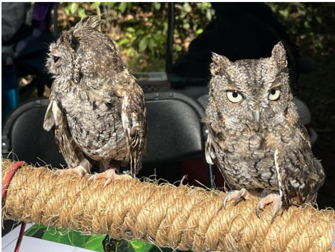
Beautiful pair of Florida Screech Owls.

There was a presentation of two Harris Hawks circling the arena in an experienced tight formation, for the enthralled adults and kids. The two desert dwelling raptors were released by their handler, to demonstrate how they usually work together to "bring home the bacon."