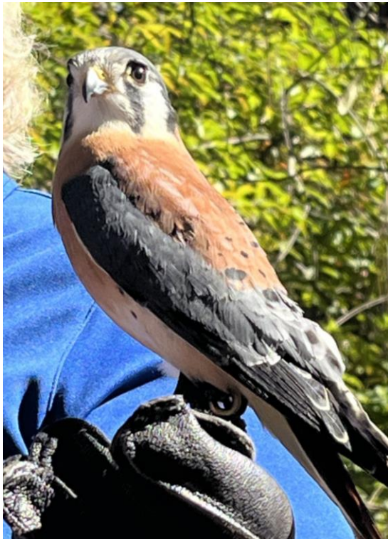
North American Kestrel Falcon