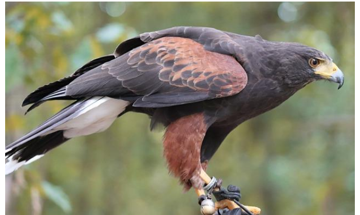
Harris Hawk