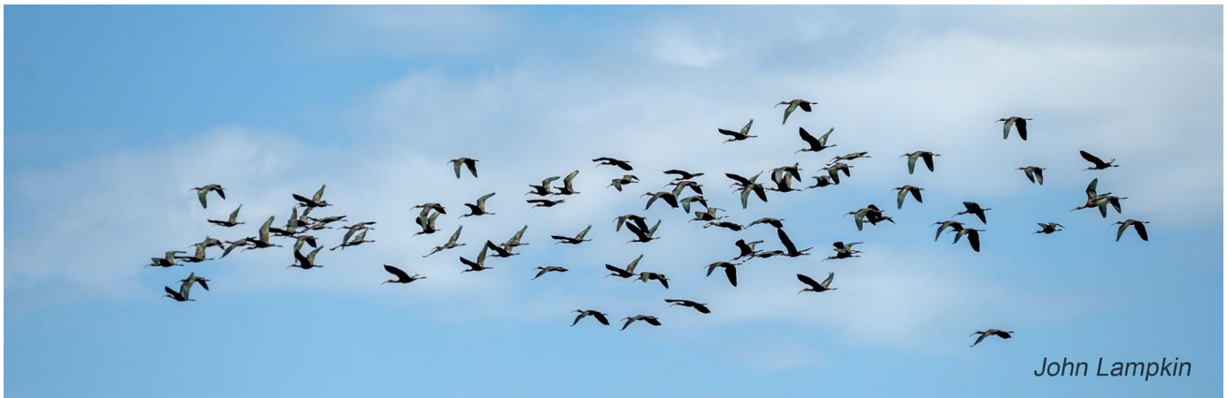
Glossy Ibis Flock