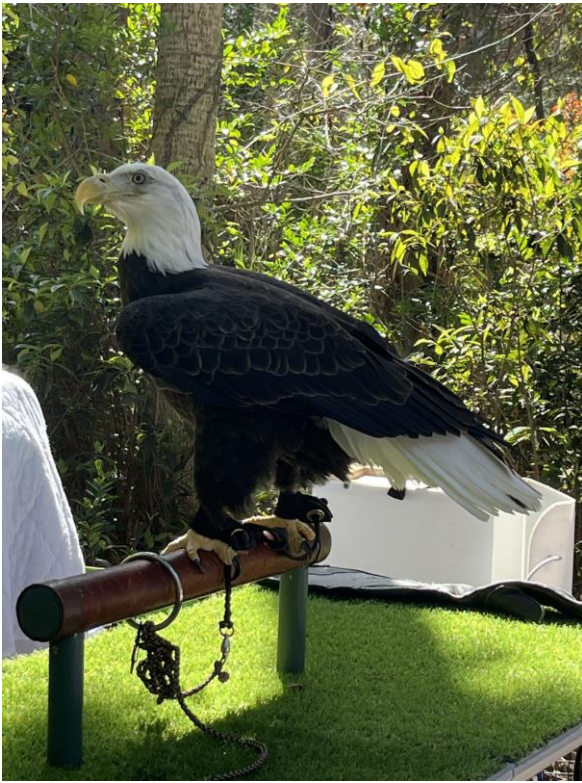
North American Bald Eagle